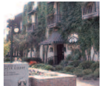
The River Room

River Room , 801 Front Street: Lunch - Dinner Monday through Saturday. Sumptuous seafood, steaks, chicken, pasta and lots of it. Enjoy views of the harbor and Harborwalk while dining inside in comfort. Reservations not accepted.