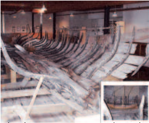
The 18th Century Brown's Ferry Vessel on Display at the Rice Museum