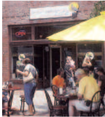
The Brown Pelican Cafe